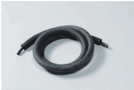
Circulation insulation hose