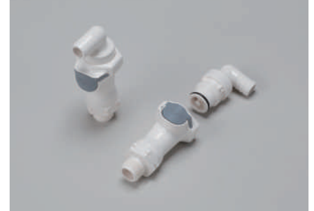
One touch rotation L-shaped nozzle