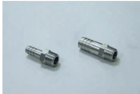
Straight circulation nozzle