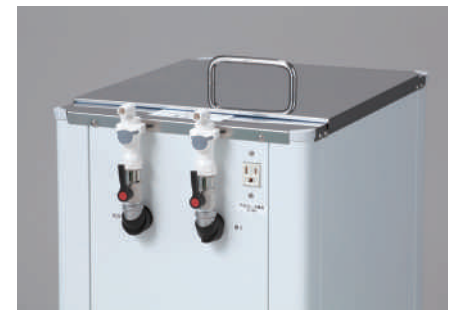
Installation of one touch rotation L shape nozzle