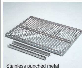
Stainless punched metal