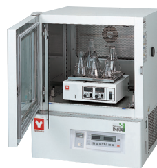
IN604W with MK161 shaker