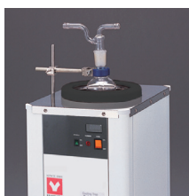
Glass condenser set