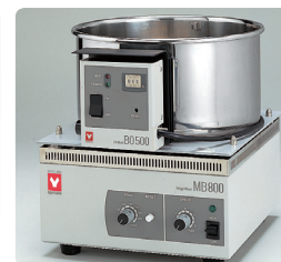
BO500 + MB800